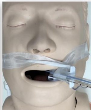
Can be flipped and protect from either side