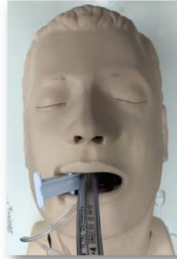
Fits securely with laryngeal mask airway (LMA)