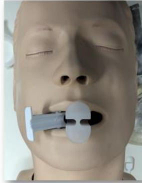
Fits securely with oral airway inserted