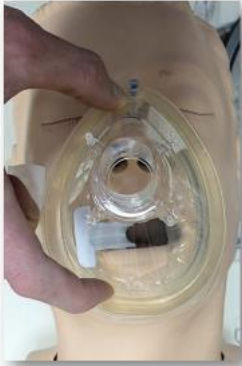
Complete Bite Block fits securely under mask to allow bag mask ventilation