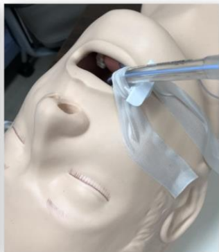
Tape further secures ET tube with Complete Bite Block