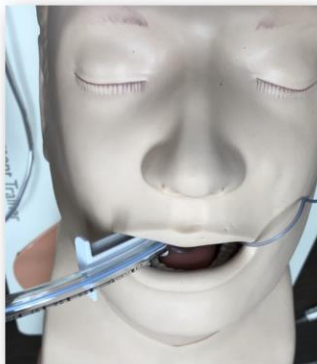
ET tube stabilized fitting along Complete Bite Block