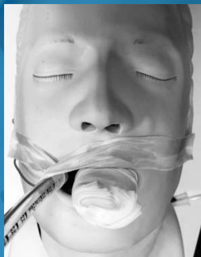
Dangerous hand rolled gauze bite blocks currently used